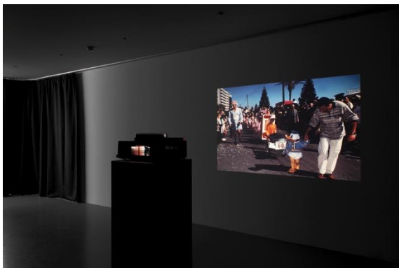
Christodoulos Panayiotou, Wonder Land , 2007, 80 colour slides, Installation view, Museum of Contemporary Art Leipzig, 2011.