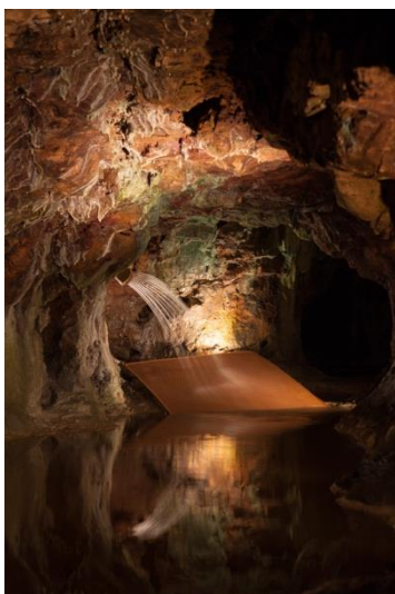
Christodoulos Panayiotou, The Price of Copper , 2018, Copper cathode, pump, water jet and hose, Installation view, Le Grand Monnayage, 8th Melle Biennale, 2018.