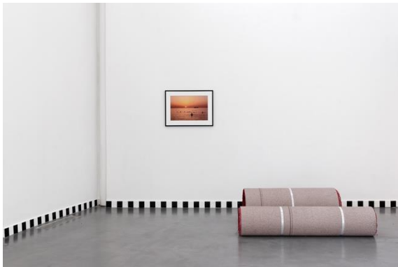
Christodoulos Panayiotou, The Price of Copper , Installation View, CAC Brétigny, 2012. Courtesy the artist. Photo: Aurélien Mole.