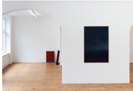
Christodoulos Panayiotou, False Form , Installation view, Rodeo London, 2016. Courtesy the artist. Photo: Lewis Roland.