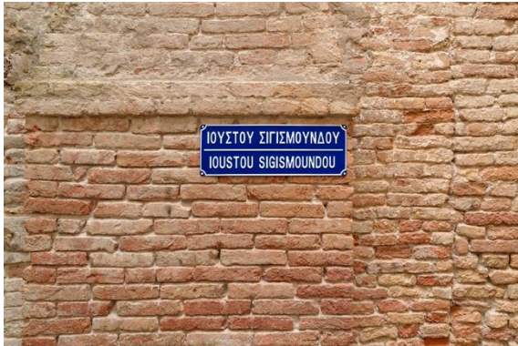
Christodoulos Panayiotou, Ioustos Sigismoundos , 2015, Street sign, Installation view, Two Days After Forever, The Cyprus Pavilion at the 56th Venice Biennale, 2015.