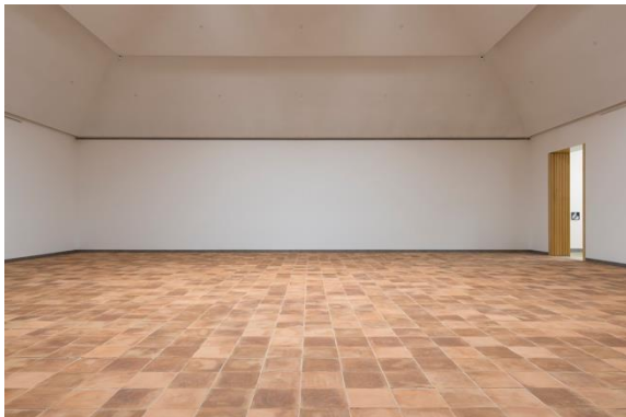
Christodoulos Panayiotou, Days and Ages , 2013, Installation view, Moderna Museet, 2013. Courtesy the artist. Photo: Åsa Lundén / Moderna Museet.