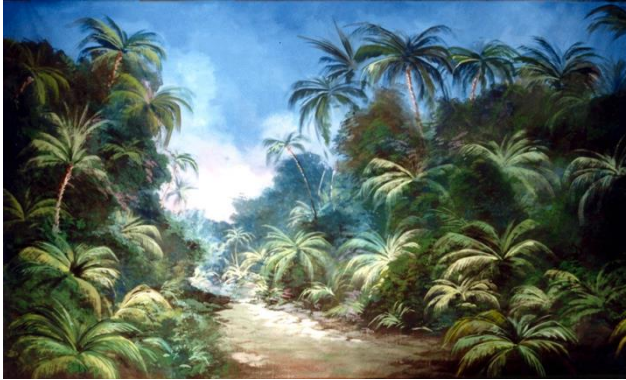
Christodoulos Panayiotou, Act II: The Island, 2008, Folded theatre backdrop. Courtesy the collection of Nicos Pattichis.