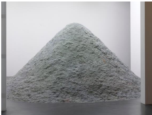
Christodoulos Panayiotou, 2008, 2008 , shredded paper (Cypriot pounds), Installation view, The End of Money, Witte de With, 2011. Courtesy the artist. Photo: Bob Goedewaagen.