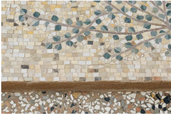
Christodoulos Panayiotou, Mauvaises Herbes (detail), 2015, natural stone floor mosaic, Two Days After Forever, The Cyprus Pavilion at the 56th Venice Biennale, 2015.