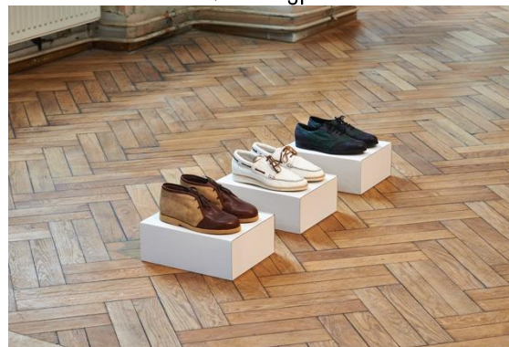
Christodoulos Panayiotou, Untitled , 2013, three pairs of handmade leather and leatherette shoes, cardboard boxes, Installation view, And, Casino Luxembourg, 2013. Courtesy the artist. Photo: Andres Lejona.