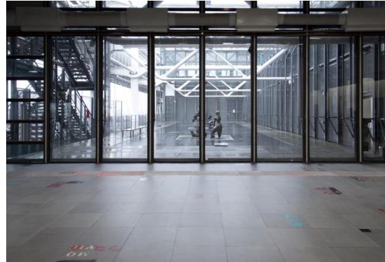
Christodoulos Panayiotou, Sectile , 2016, black granite and Zeus quartzite tiles, Installation view, Centre Pompidou, 2018. Courtesy the artist. Photo: Julie Joubert