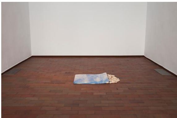
Christodoulos Panayiotou, Nowhere , 2011, Folded theatre backdrop, Installation view, Joan Miró Foundation, Barcelona, 2011. Courtesy the artist. Photo: ArtAids Foundation.