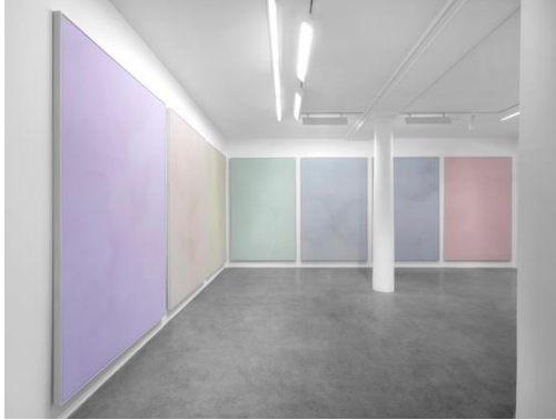
Christodoulos Panayiotou, Untitled (5, 10, 20, 50, 100, 200, 500) , 2016, Pulp paintings polyptich, installation view, Galerie kamel mennour, 2016.

Christodoulos Panayiotou Act II: The Island 27 September 2019 - 5 January 2020