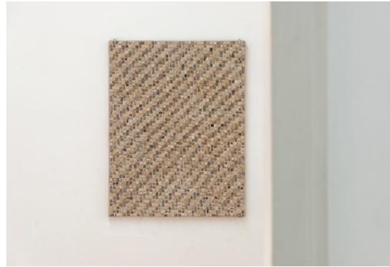
Christodoulos Panayiotou, Opus Tessellatum , 2015, wall mosaic, ancient limestone tesserae, Installation view, Two Days After Forever, The Cyprus Pavilion at the 56th Venice Biennale, 2015. Courtesy the artist. Photo: Aurélien Mole / The Cyprus Pavilion.