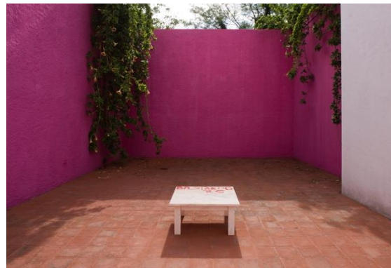
Christodoulos Panayiotou, Untitled , 2017, Estremoz Rosa marble bench, Installation view, Mármol Rosa, Casa Luis Barragán, 2017. Courtesy the artist. Photo: Ramiro Chaves / Estancia FEMSA.