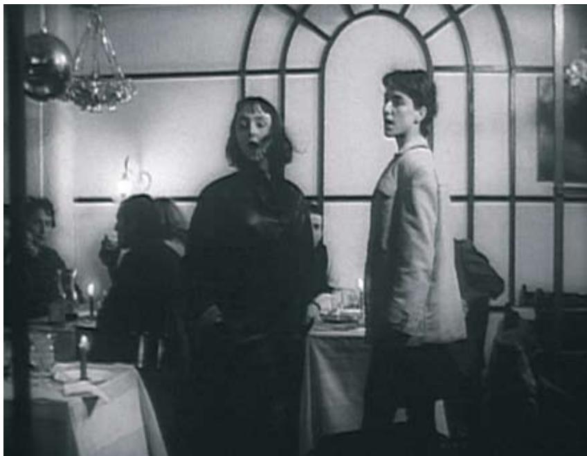
J'ai faim, j'ai froid (I am cold, I am hungry) 1984 35mm, 12 min / B&W Production: JM Productions / Films A2