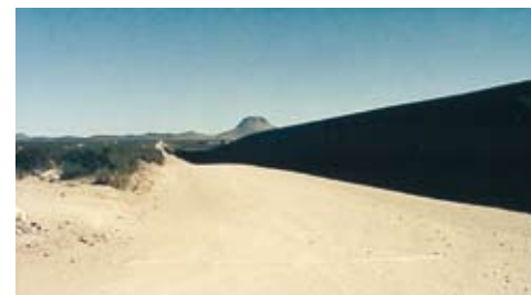
De l'autre côté (From the other side) 2002 Documentary, video/16mm, 102 min, colour Production, Amip, Chemah IS, Arte