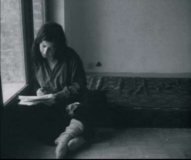
Je, tu, il, elle (I, you, he, she) 1975 35mm, 90min, B&W / Production: Paradise Films, Brussels

‘Life is like a fountain. Why? Ok life is not like a fountain.’