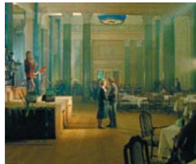
D'Est (From the East) 1993 Documentary, 35mm, 107 min, colour Production: Paradise Films, Brussels / Lieurac production, Paris

D'Est (From the East), 1993 and Sud (South of Europe), 1998/9 are as similar as they are opposed. Un Divan à New York (A Couch in New York), 1996 and La Captive (The Captive), 1999 constitute two cardinal points in the conception of amorous union: a couple that is osmotic in spite of geographical distance, and a couple that grows apart in the closeness of captivity. Thus everything is opposed and yet fits together in this body of work characterised by its shifting styles. From Jeanne Dielman , 1975 to Le Déménagement (The Move), 1992 from La Chambre (The Room), 1972 to Les rendez-vous d'Anna (The Meetings of Anna), 1978 Akerman puts